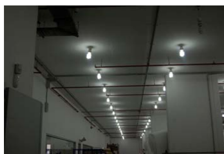
Power Savings Bulbs