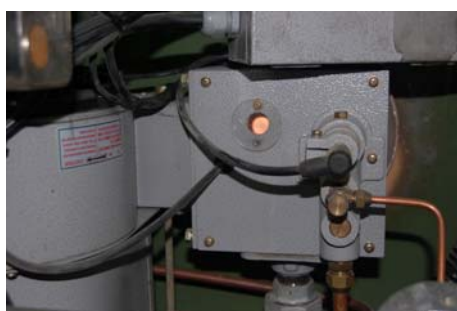
Usage of One Burner