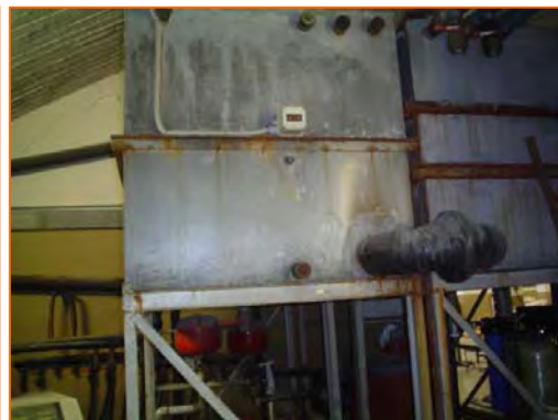
Insulation of cold water tank in order to stop 6 °C losses in heat and therefore save energy