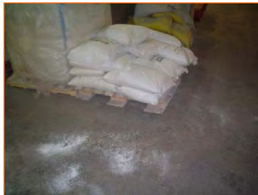
Good housekeeping in order to stop the leakage of resources

ULPI recycled 0.2% of plastics from pipes cuttings including some unmeasurable good housekeeping options as shown in photos below: