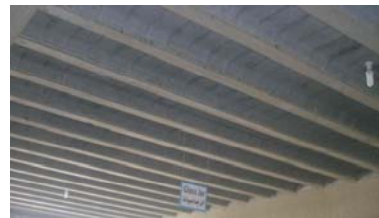
Power Saving Bulbs